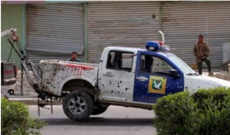
Damaged occupation police vehicle, hit by a roadside bomb, in Baghdad March 20, 2006.

21/03/06 VANESSA ARRINGTON (AP) & By SINAN SALAHEDDIN, The Associated Press & Reuters & Aljazeera & March 18, 19, 20, 21 Reuters