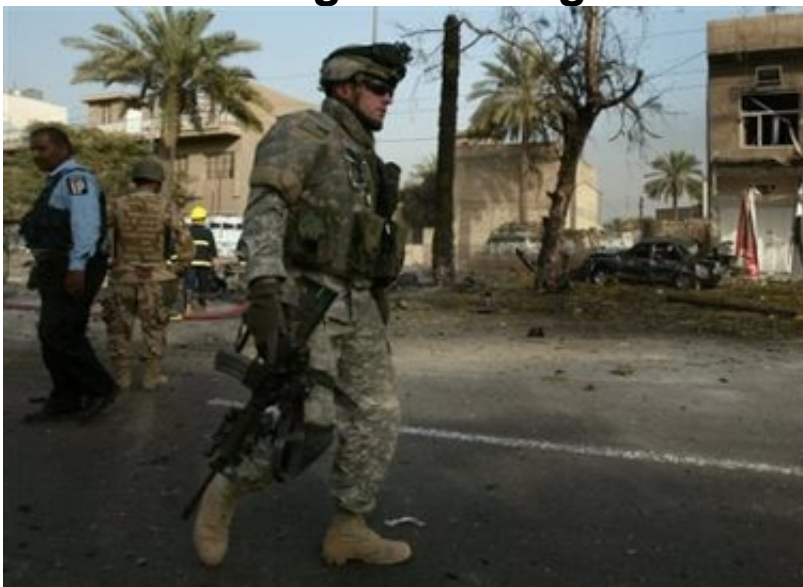
A U.S. soldier at the scene of a car bomb attack in Baghdad March 13, 2006.