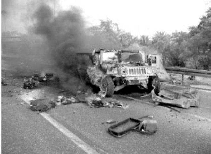
A Humvee destroyed by a roadside IED