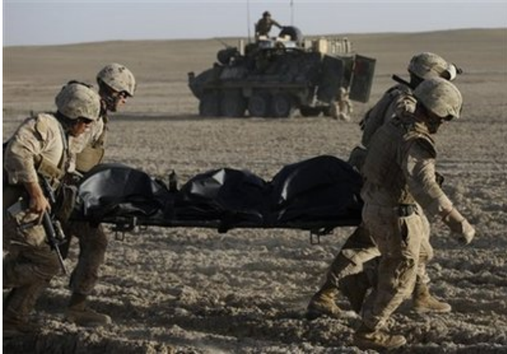
March 1, 2010: U.S. Marines carry the body of a comrade to a waiting U.S. Army Task Force Pegasus medevac helicopter, in Helmand province, Afghanistan.