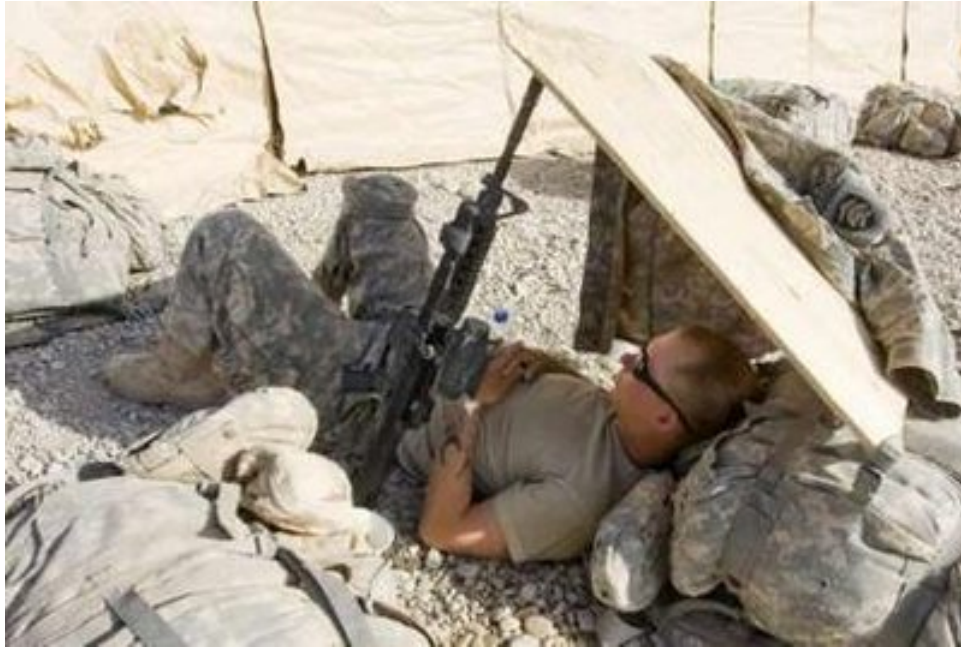
A soldier with Army National Guard 162 Engineer Company attached with 2nd Combat Engineer Battalion of U.S. Marine Corps after returning from a route clearance mission at Camp Leatherneck in Helmand province, southern Afghanistan, March 10, 2010.