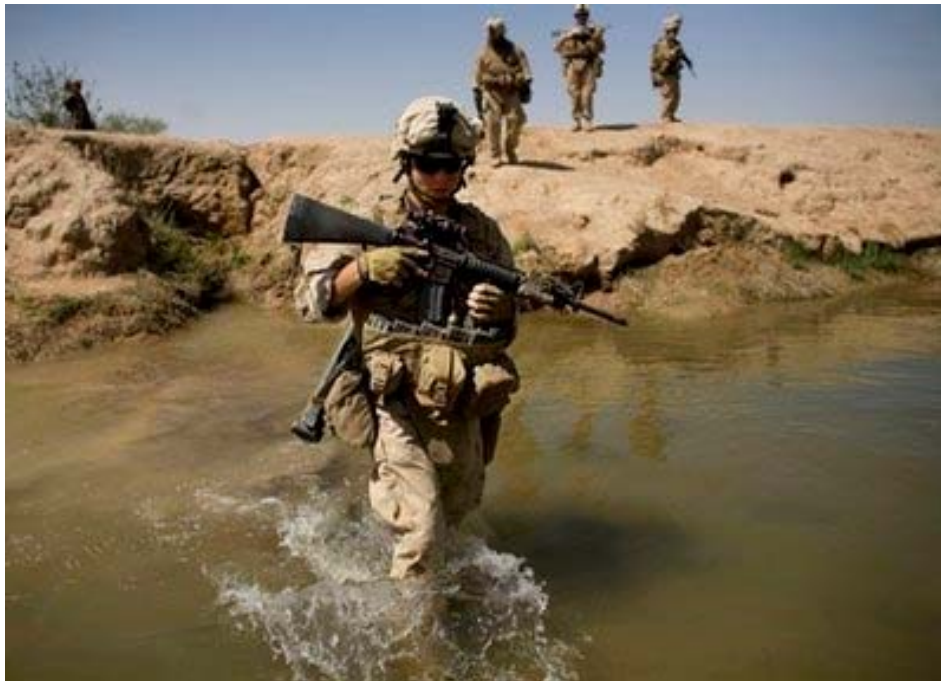
U.S. Marine with the First Battalion, Sixth Marine Regiment, Alpha company during a patrol in Marjah, Afghanistan, March 19, 2010.