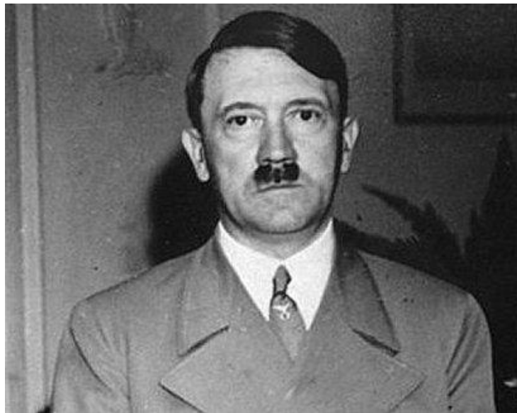
Am 30. Januar 1933 wurde Adolf Hitler als Reichskanzler vereidigt.